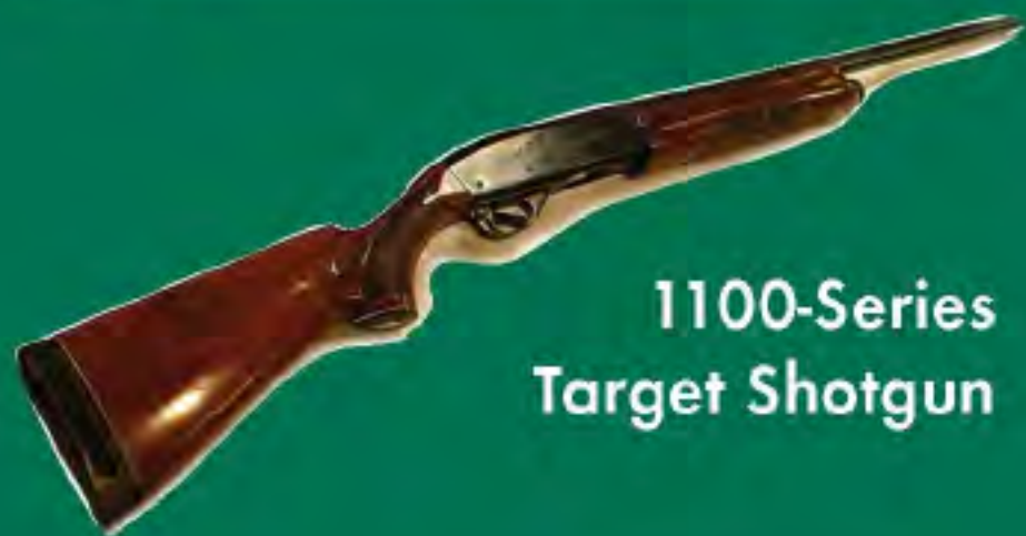
1100-Series Target Shotgun

Purchase any Remington 1100-Series Target Shotgun and Receive a FREE Flat of Gun Club Target Ammo!